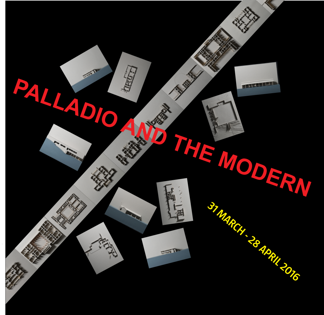
the architect pop up gallery CIFA 71 hout street, Cape Town 31 MARCH - 28 APRIL 2016